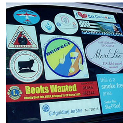
Print your own professional looking window decals.

HPS LLC is a main manufacturer and distributor in the USA of digital media and associated finishing film and products for the desktop publishing industry. To see our product selection please go to our information site www.papilio.com .